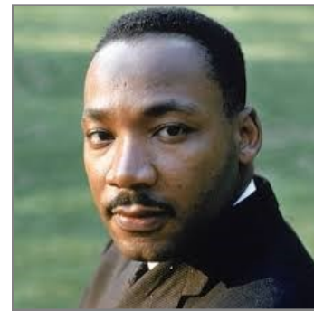
Rev. Dr. Martin Luther King, Jr.

You have the power, in both of these visions, the spiritual and the spirit-in-nature, to begin the change you want to see. And you have the power to stand against the entire world in those times when the world sinks into the confusion of greed and violence. In terms of a mutual support network, Gandhi’s vision allows us to see one another as partners in the mobilization of that profound compassionate intelligence, hidden, but yearning to be born, in every human being. ( Mahatma Gandhi Study Resources )